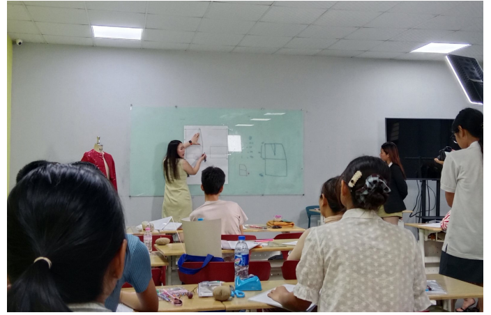
Presenting Pattern Training