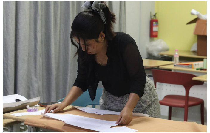
Presenting Pattern Training