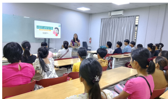
MGMA presenting PSEA