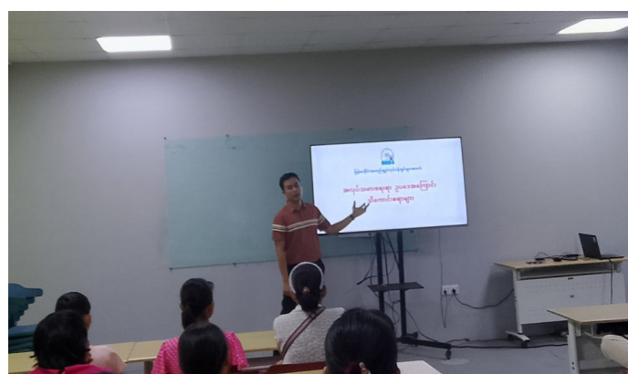
MGMA conducting Labor Law Awareness