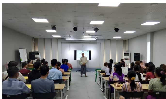
Principle of GTHS giving opening remarks