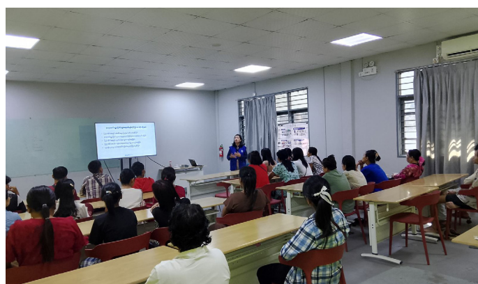
Migration Seminar by IOM