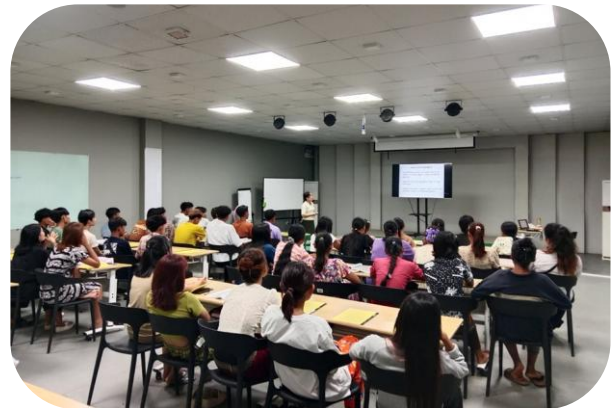
Manager of MGHRDC giving Opening Remarks