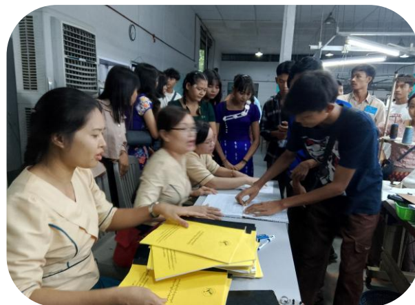
Trainer of MGRDC presenting Sewing Method