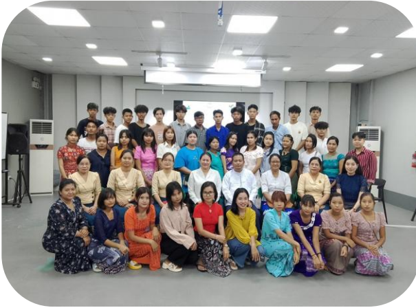
Batch – 254 Group Photo

B asic Sewing Machine Operator Training (Batch – 254) was held from May 19 th to June 6 th 2025 at Myanmar Garment Human Resources Development Training Center (MGHRDC), organized by Myanmar Garment Manufacturers Association (MGMA).