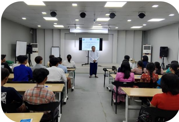
Principle of GTHS giving Closing Remarks

practice session. MGMA conducted the awareness of labour law in factory. Total (40) trainees attended the training and awarded certificate.