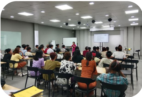
MGMA conducting Labor Law Awareness