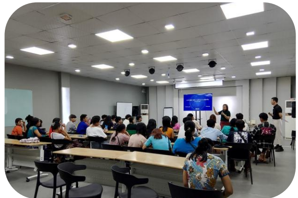
Safe Migration Seminar by IOM