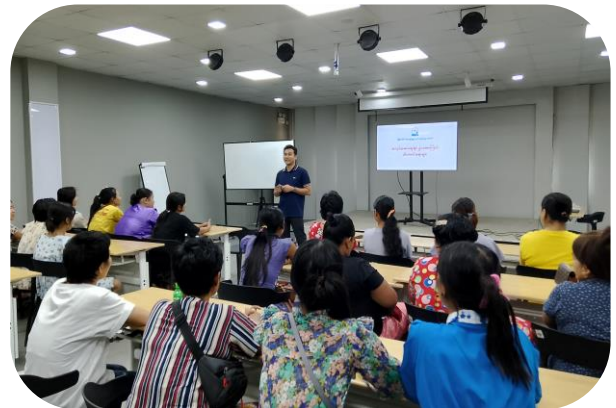
MGMA conducting Labor Law Awareness