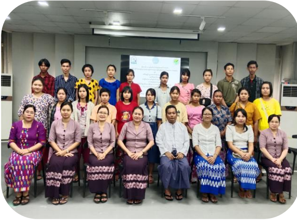
Batch – 250 Group Photo

B asic Sewing Machine Operator Training (Batch – 250) was held from February 17 th to March 7 th 2025 at Myanmar Garment Human Resources Development Training Center (MGHRDC), organized by Myanmar Garment Manufacturers Association (MGMA).