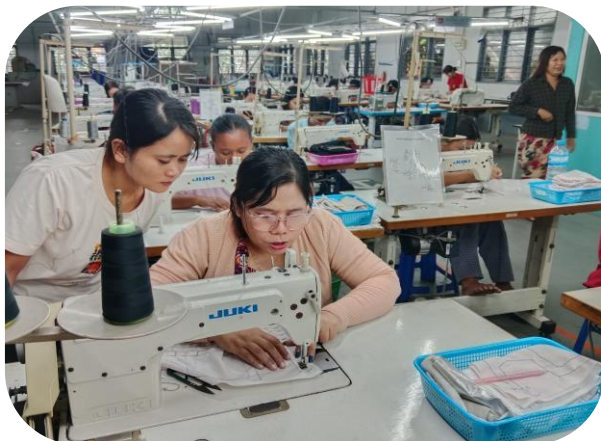
Trainer of MGHRDC presenting Sewing Method