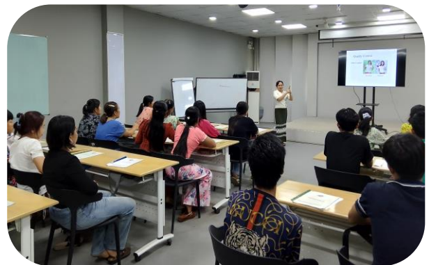
Trainer of MGHRDC presenting Sewing Method