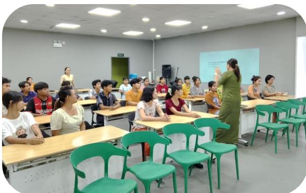
Trainer of MGHRDC presenting Sewing Method