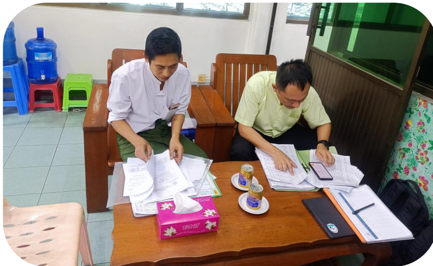
Golden-5 Garment Manufacturing Co., Ltd

Inspected factory that Golden-5 Garment Manufacturing Co., Ltd on March 7 th and Senior Labour Officer of MGMA scrutinized all the documents relation to the VLCA. Voluntary Labour Compliance Assessment is an assessment tool implemented by the collaboration project between MGMA and ILO/ACTEMP, Bureau for Employer Activity under International Labor Organization, in 2019. VLCA was officially launched on 17 th February 2020 by MGMA to all its member factories.