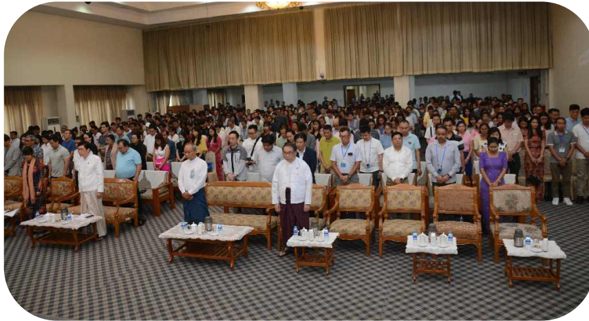
During One Minute Silence While Standing

C urrent Situation of Myanmar's garment Sector Seminar was held on 2025, March 25 th at Mingalar Hall, UMFCCI Office Tower, organized by Myanmar Garment Manufacturers Association (MGMA).