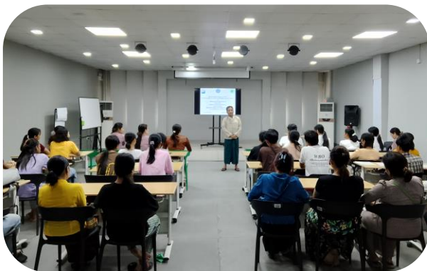
Principle of GTHS giving Opening Remarks