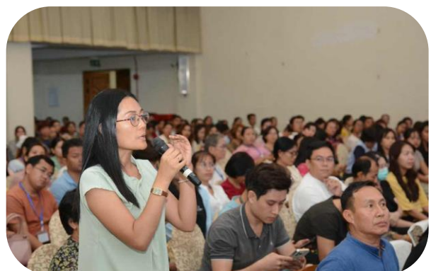
Q & A Session