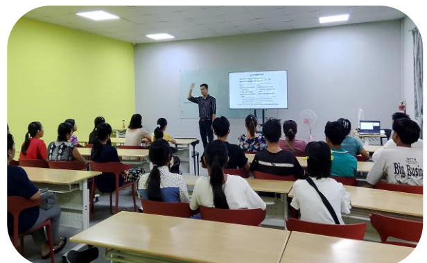
MGMA conducting Labor Law Awareness