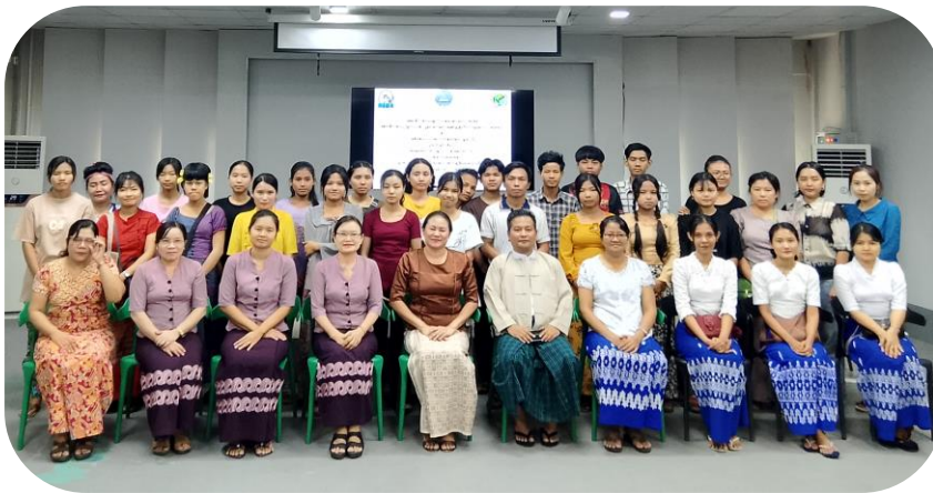
Batch – 251 Group Photo

B asic Sewing Machine Operator Training (Batch – 251) was held from March 10 th to 28 th , 2025 at Myanmar Garment Human Resources Development Training Center (MGHRDC), organized by Myanmar Garment Manufacturers Association (MGMA). Principle of Government Technical High School (Ywarma) U Zayyar Aung gave opening and closing remarks. In this training, training instructor from MGHRDC lectured knowledge of sewing and sewing method step by step with practice session. MGMA conducted the awareness of labour law in factory. Total (26) trainees attended the training and awarded certificate.