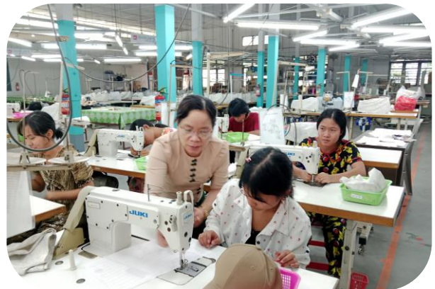
Trainer of MGHRDC presenting Sewing Method