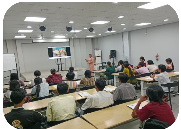
Trainer of MGHRDC presenting Sewing Method