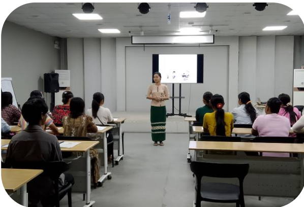
Trainer of MGHRDC presenting Sewing Method