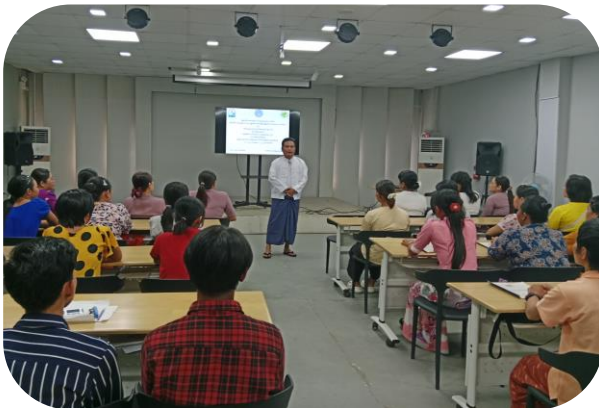
Principle of GTHS giving Closing Remarks

practice session. MGMA conducted the awareness of labour law in factory. Total (17) trainees attended the training and awarded certificate.