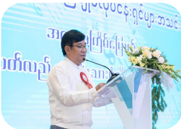
Secretary of Election commission announcing names of MGMA EC for 2024-2027