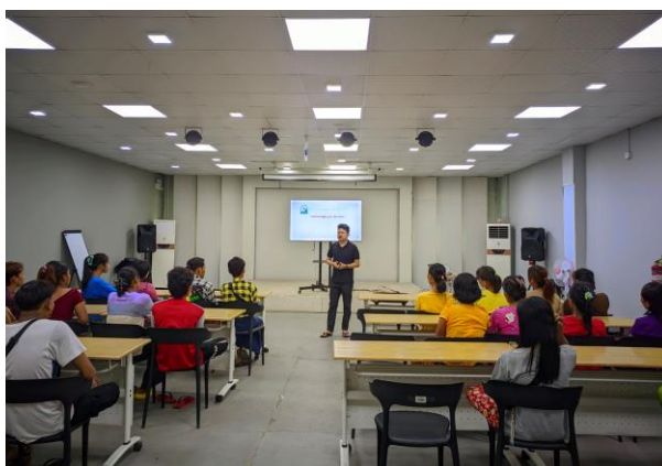
MGMA conducting Labour Law Awareness