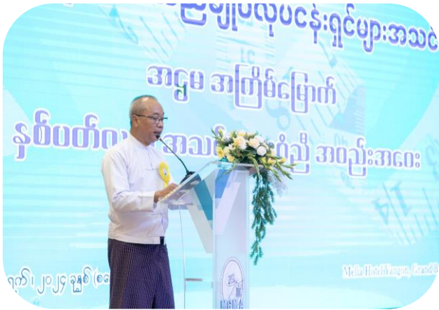
Chairman of MGMA giving welcome speech