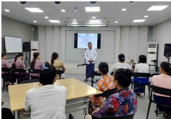
Principle of GTHS (Ywarma) giving opening remarks