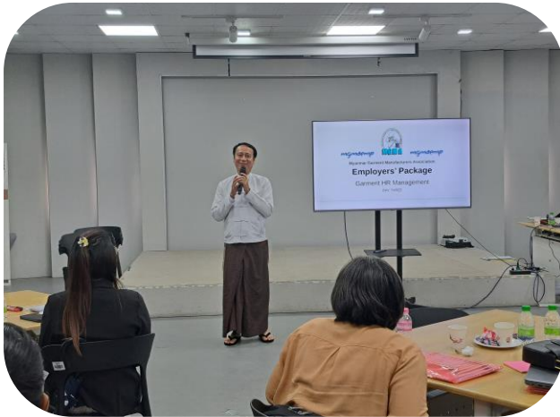
CEC of MGMA U Tun Tun giving closing remarks

Garment HR Management Training (Batch - 2) was held on 2024, 9 th – 16 th – 23 rd June at Myanmar Garment Human Resource Development Center (MGHRDC), organized by Myanmar Garment Manufacturers Association (MGMA).