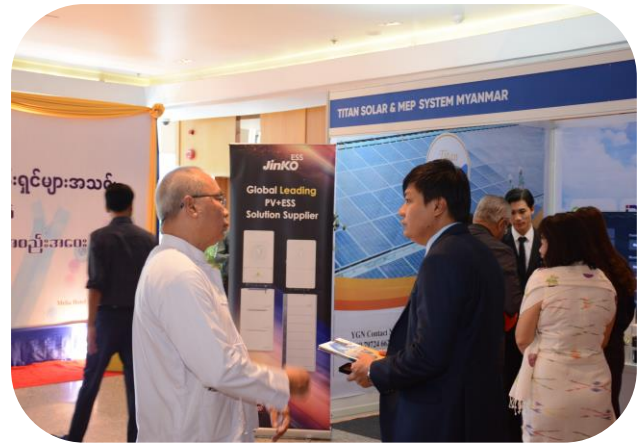
Titan Solar & MEP System Myanmar Booth