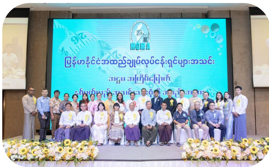
MGMA's EC and Garment Stakeholders