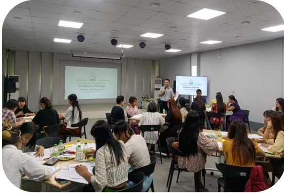
Senior Labour Officer of MGMA presenting Garment HR