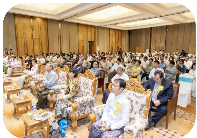
Delegations and Guests