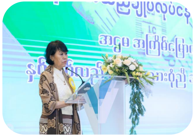
Secretary General of MGMA presented financial report