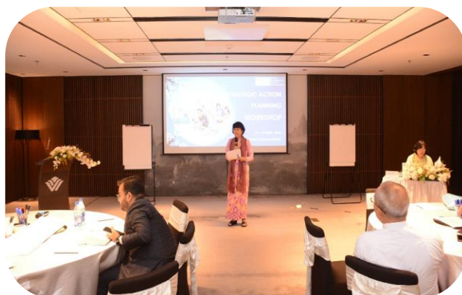
Secretary General of MGMA introducing of 10 - year strategy