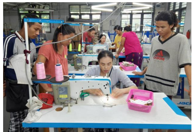
Trainer of MGHRDC presenting sewing method