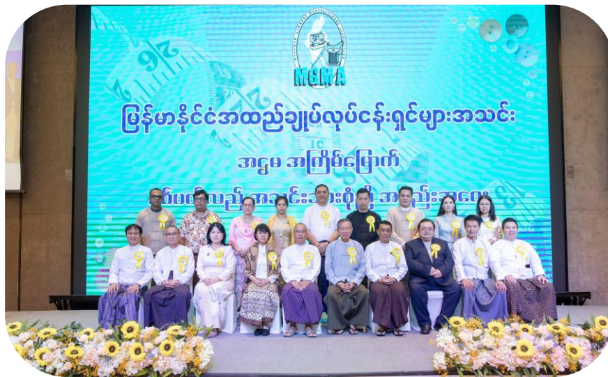
MGMA Executive Committee Members (2024-2027)