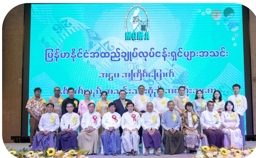
UMFCFI's Chairman, Election Commission and MGMA Executive Committee Members

The meeting attended by Patron, Chairman of UMFCFI, Chairman, Vice-Chairmen, Secretary General and CEC-EC members of MGMA, foreign garment cluster association members in Myanmar and owner and representatives from member factories to the event and take group photo in the final wrap up. Titan Solar & MEP System Myanmar is supported to this event and explained their products and services to members.