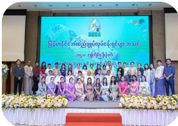
MGMA's EC and Office Secretariat