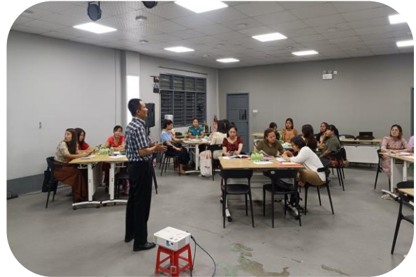
Senior Labour Officer of MGMA presenting Garment HR