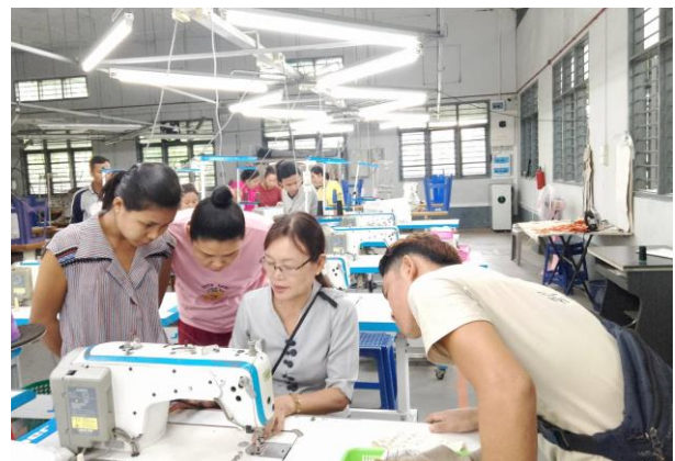
Trainer of MGHRDC presenting sewing method