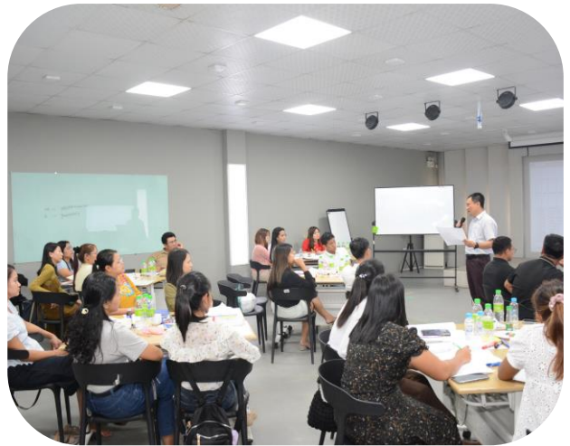
Senior Labour Officer of MGMA presenting Garment HR Management