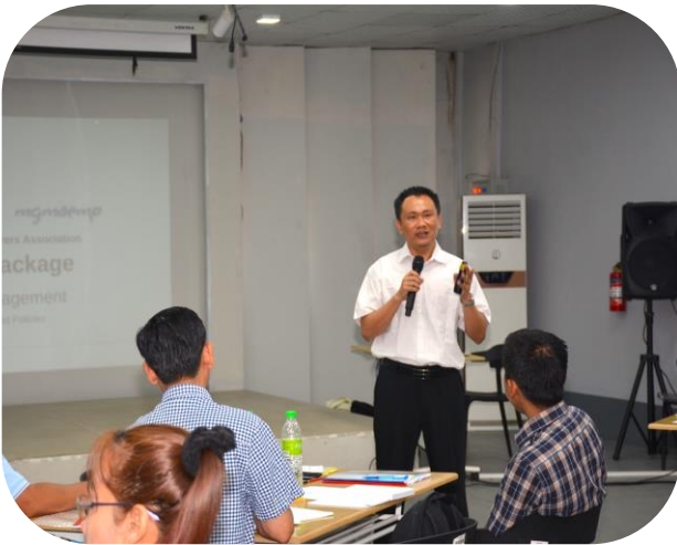
Senior Labour Officer of MGMA presenting Garment HR Management