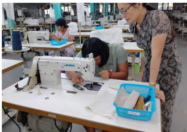
Trainer of MGHRDC presenting sewing method