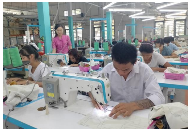
Trainer of MGHRDC presenting sewing method