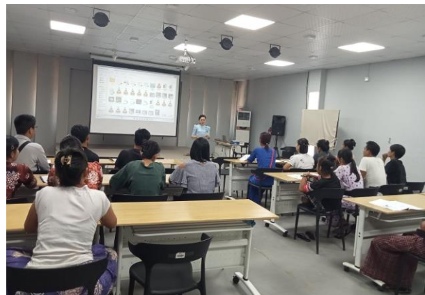
Trainer of MGHRDC presenting sewing method