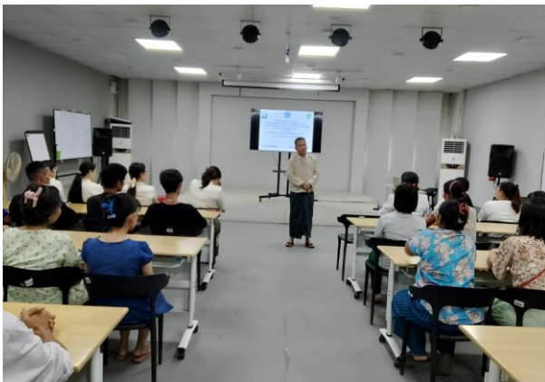
Principle of GTHS (Ywarma) giving opening remarks