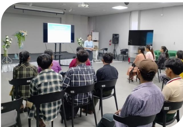
Trainer of MGHRDC presenting sewing method