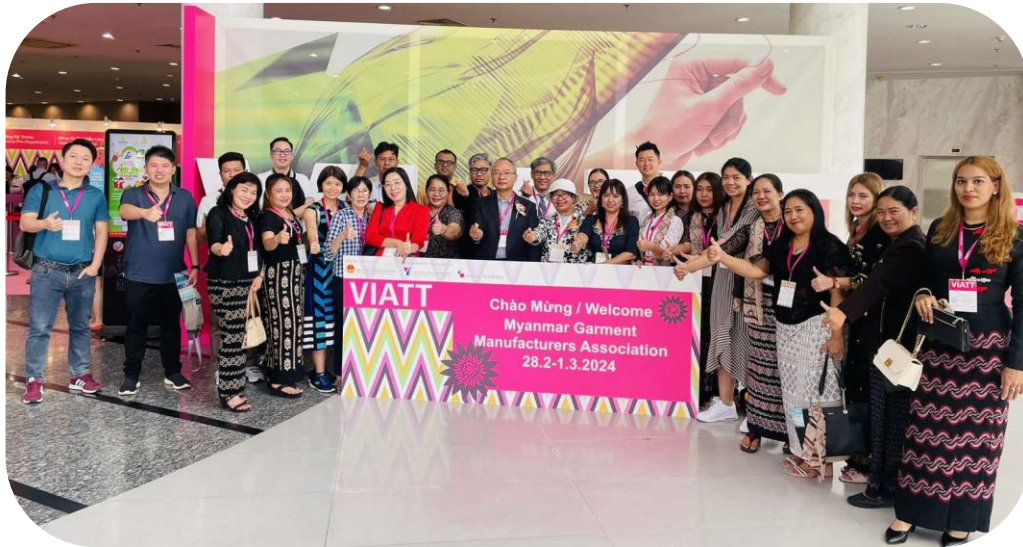
MGMA's Chairman, Executive Committee, MRGMA and Delegates of MGMA Member Factories Group Photo