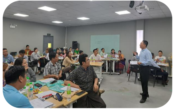
Labour Officer Team from MGMA presenting OSH