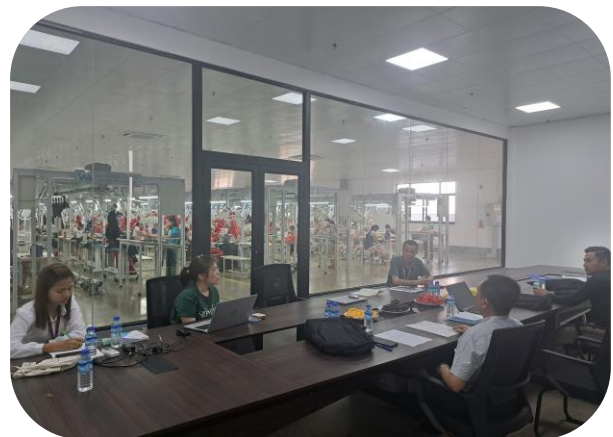
Sincere Season (Myanmar) Garment Co., Ltd