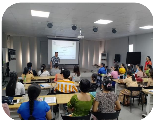
Executive Committee of MGMA U Ye Khant giving closing remarks