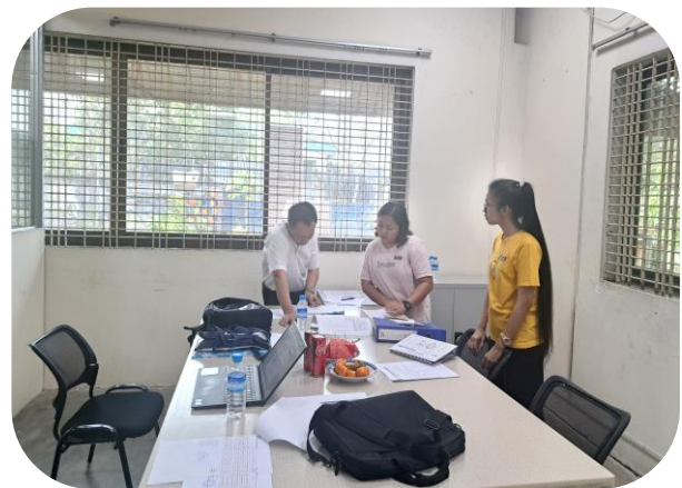
Lat War Co., Ltd (Factory-2)