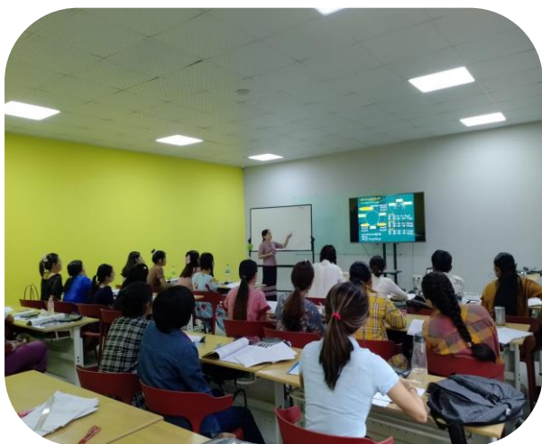
Trainers from MGRDC presenting IE