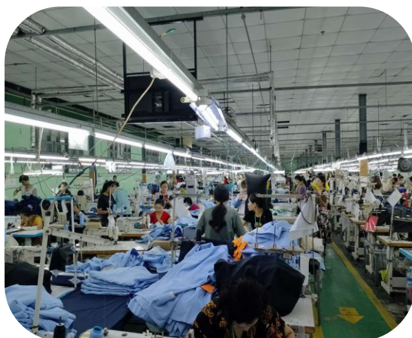
Factory Practice at Star Sandar Garment Co.,Ltd