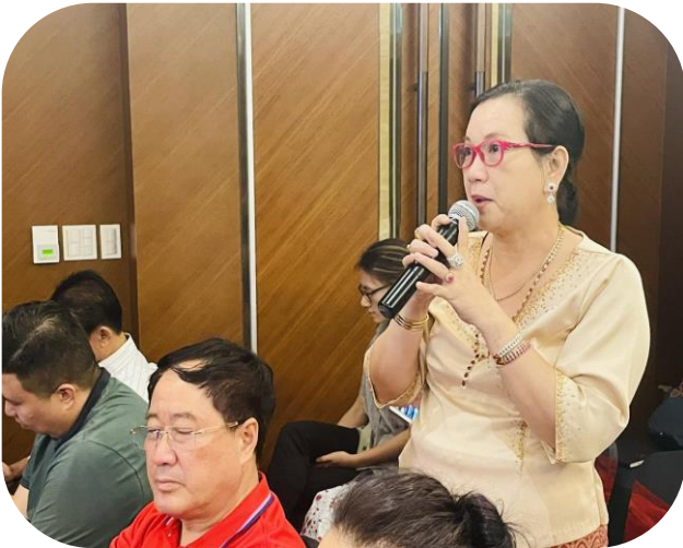
Q & A session