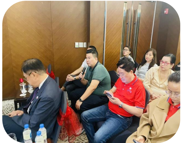
Q & A session