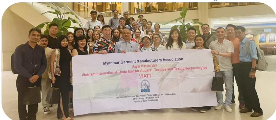
Networking Dinner Group Photo