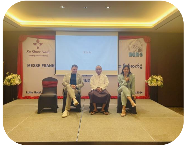
Q & A session