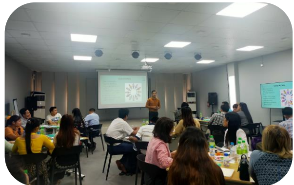
Labour Officer Team from MGMA presenting OSH