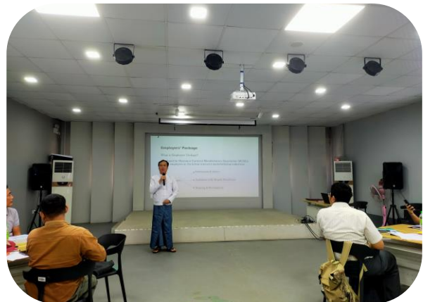
Central Executive Committee of MGMA U Tun Tun giving opening remarks