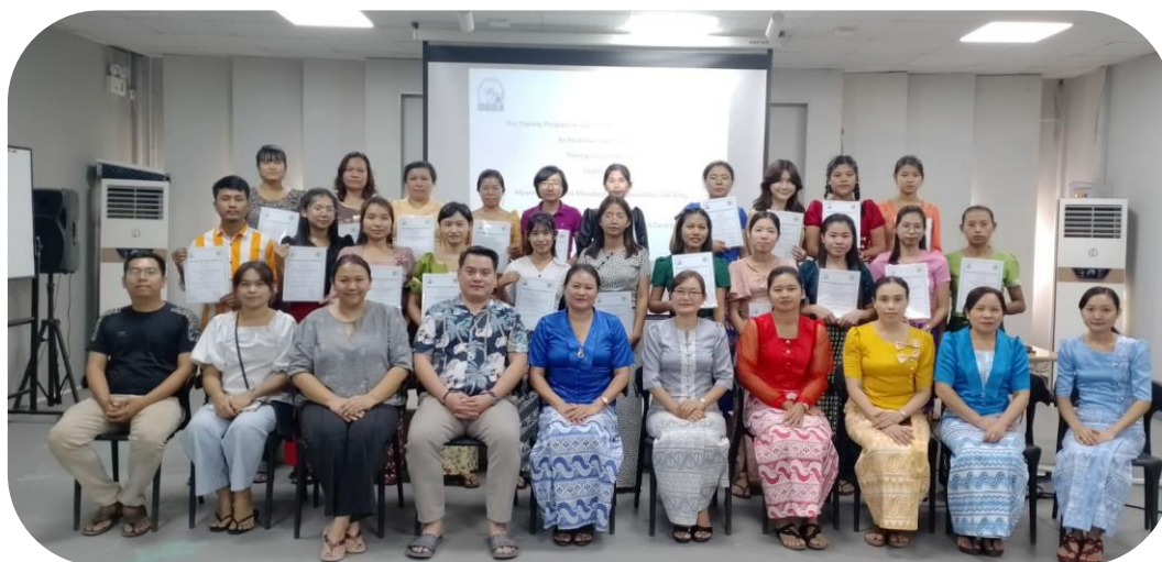
Batch – 79 Group Photo