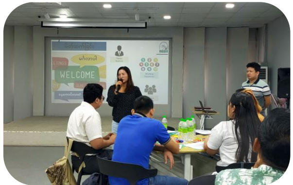
Labour Officer Team from MGMA presenting OSH