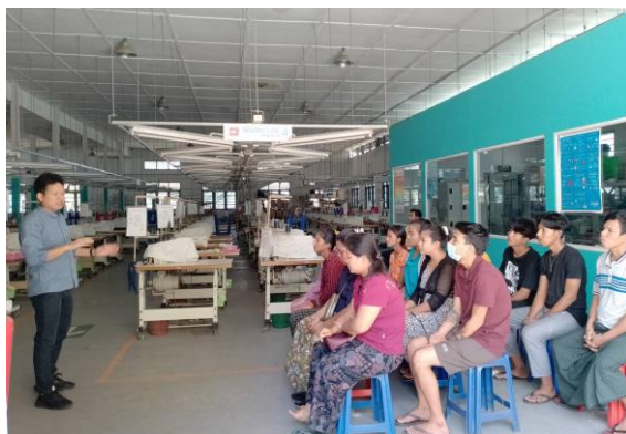
MGMA Conducting labour law awareness