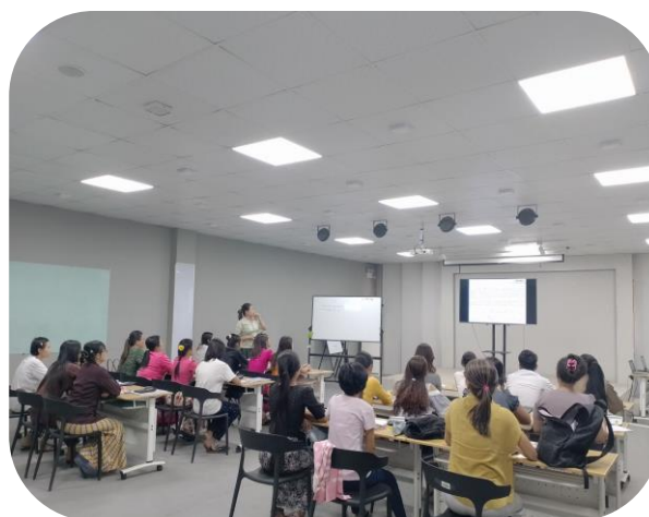
Trainers from MGHRDC presenting IE