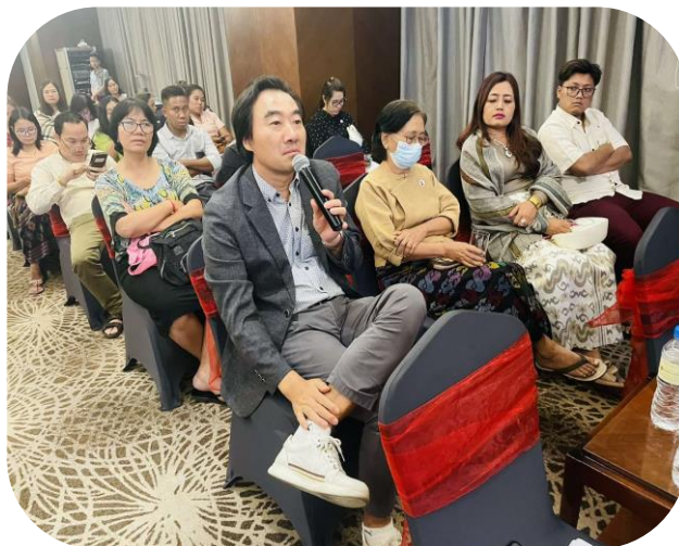
Q & A session