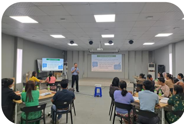
Senior Labor Officer of MGMA presenting Labor Law Awareness

L abour Law Awareness Training was held on December 19 th , 2023, at Myanmar Garment Human Resources Development Training Center (MGHRDC), organized as compulsory training of Batch (28) by Myanmar Garment Manufacturers Association (MGMA).