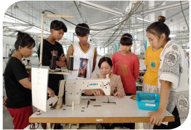
Trainers from MGHRC gave sewing methods