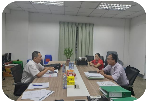
Shaungxi (Myanmar) Garment Co.,Ltd