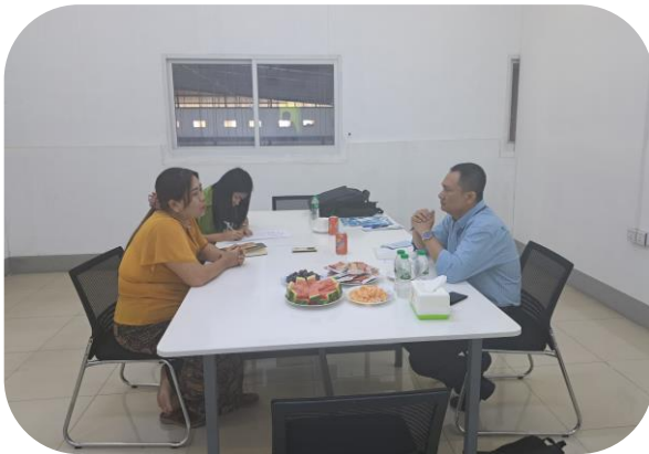
J-Land Myanmar Co.,Ltd

Voluntary Labour Compliance Assessment is an assessment tool implemented by the collaboration project between MGMA and ILO/ACTEMP, Bureau for Employer Activity under International Labor Organization, in 2019. VLCA was officially launched on 17 th February 2020 by MGMA to all its member factories.