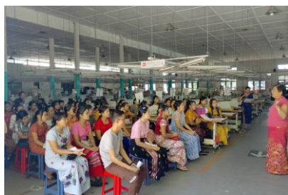
Refresher and Familiarization Day