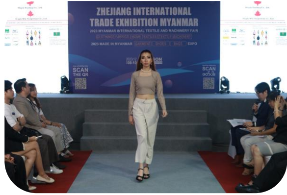
Fashion Show for International Brand