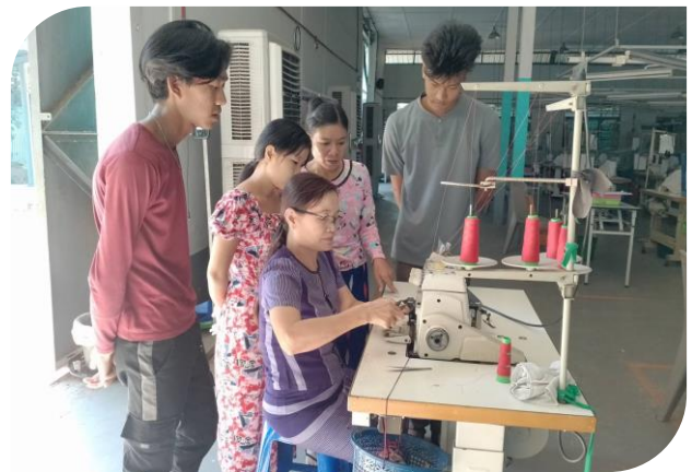
Trainers from MGHRC gave sewing methods