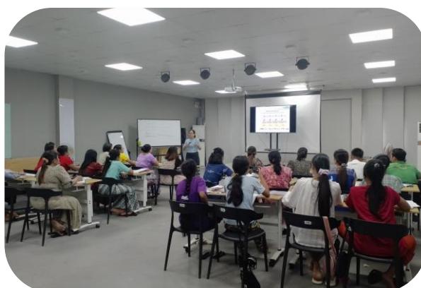
Trainers from MGHRDC gave IE Methods