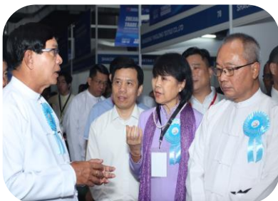
H.E Minister tour around the expo