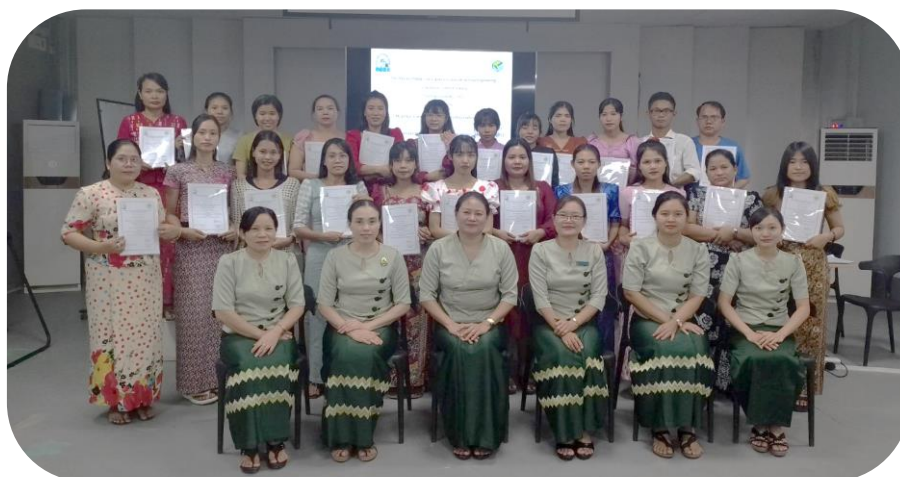
Batch – 78 Group Photo

M yanmar Garment Manufacturers Association (MGMA) organized Industrial Engineering in garment industry (10 days) Training (Batch – 78) was held from December 11 st to 22 nd , 2023 at Myanmar Garment Human Resources Development Center (MGHRDC).