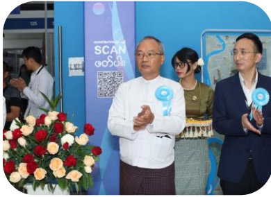
H.E Minister, Yangon Region Government U Soe Thain delivering opening speech