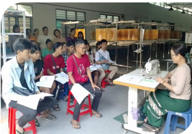
Trainers from MGHRDC gave sewing methods