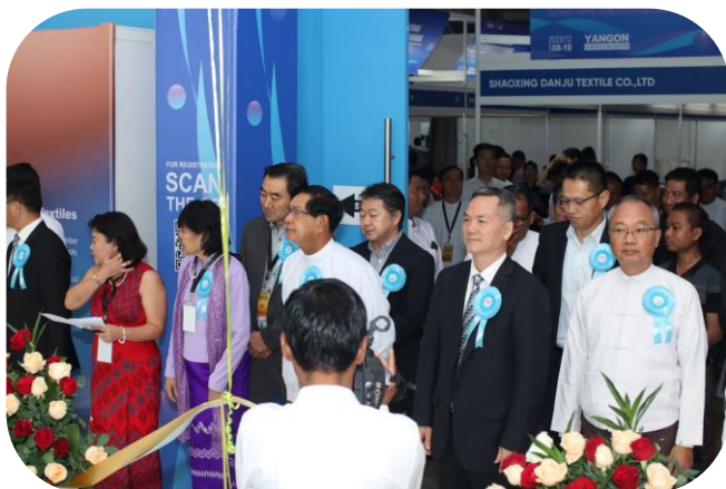
During Ribbon Cutting Ceremony

M yanmar International Textile and Machinery Fair 2023 was held on December 8,9,10 at Inya Lake Hotel, Yangon Convention Center (YCC).