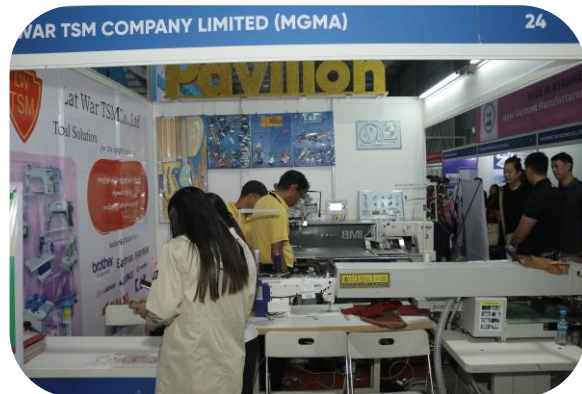
Made In Myanmar Pavillion