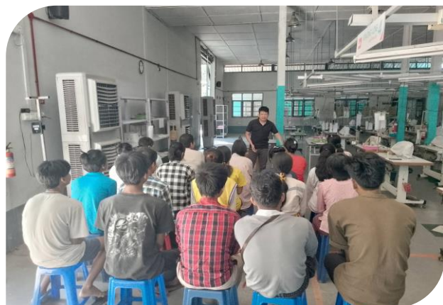
MGMA conducting the awareness of labour law