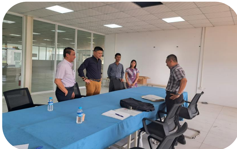
Wonderful Apparel Co.,Ltd