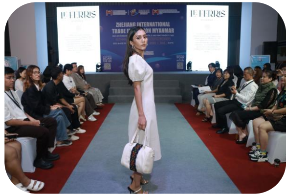
Fashion Show for SME Local Brand