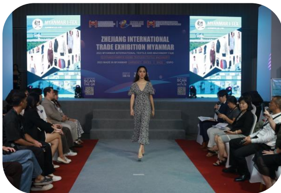
Fashion Show for International Brand