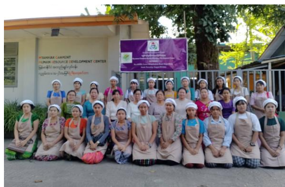
Accessor Team and Operator Workers Group Photo