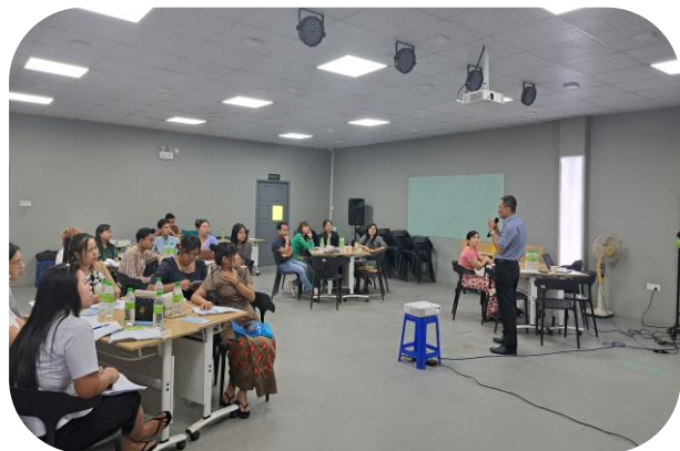
Q & A and Discussion Session

In accordance with mandatory of MGMA, the purpose of this training is to strengthen compliance with labour law awareness in the garment factories.