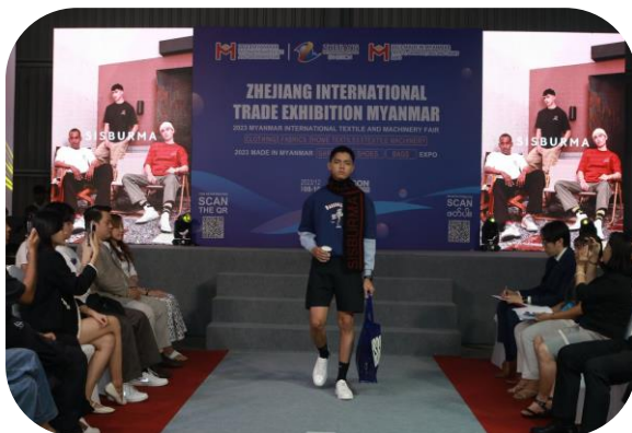
Fashion Show for SME Local Brand