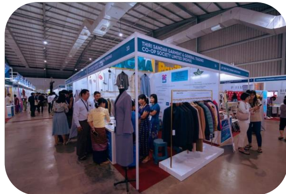
Made In Myanmar Pavillion