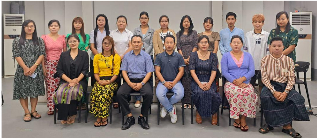
Batch – 28 Group Photo

L abour Law Awareness Training was held on December 19 th , 2023, at Myanmar Garment Human Resources Development Training Center (MGHRDC), organized as compulsory training of Batch (28) by Myanmar Garment Manufacturers Association (MGMA).