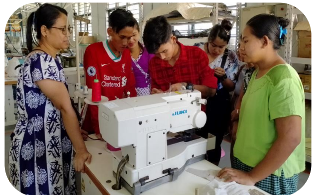
Trainer of MGHRDC giving training method