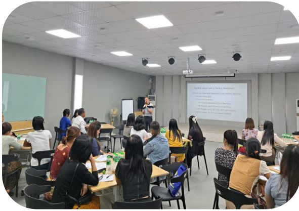
Senior Labor Officer of MGMA presenting Labor Law Awareness