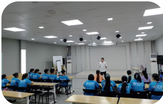
MGMA conducting Labour Law Awareness