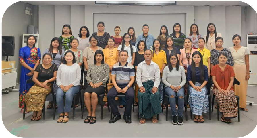
Batch – 26 Group Photo

L abour Law Awareness Training was held on November 14 th and 24 th - 2023, at Myanmar Garment Human Resources Development Training Center (MGHRDC), organized as compulsory training of Batch (26 & 27) by Myanmar Garment Manufacturers Association (MGMA).