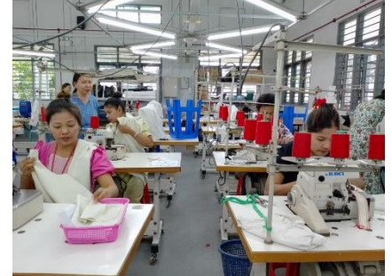
Jiangsu Soho (Myanmar) Garment Co.,Ltd