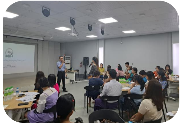
Q & A and Discussion Session