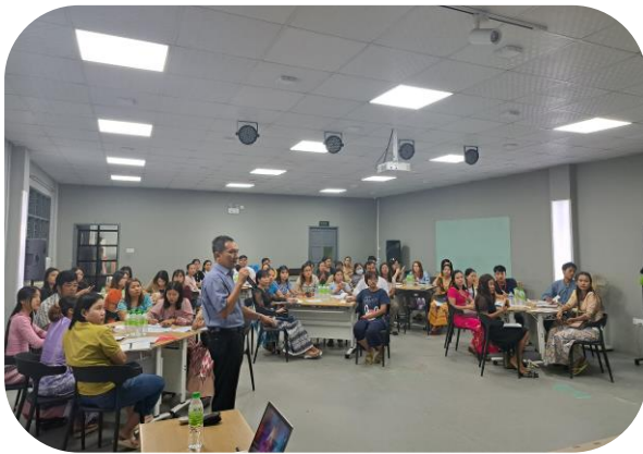
Senior Labor Officer of MGMA presenting Labor Law Awareness