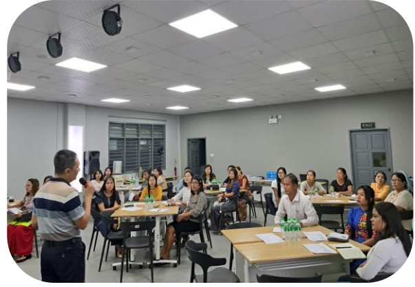
Q & A and Discussion Session