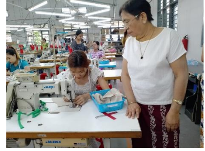
Eslite Garment Co.,Ltd