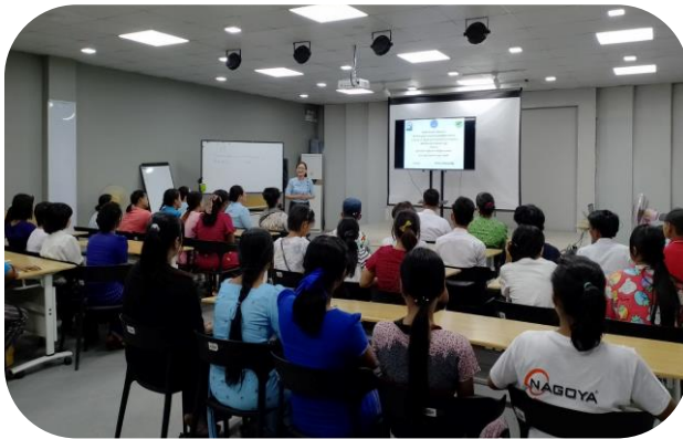
Trainer of MGHRDC giving training method