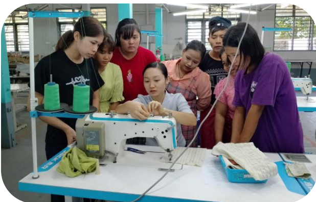
Trainer of MGHRDC giving training method