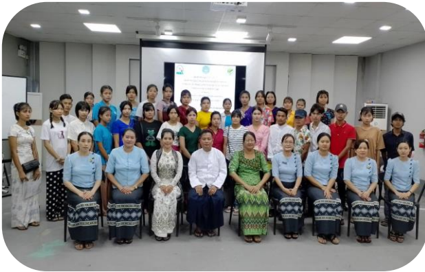
Batch – 229 Group Photo

In this training, training instructor from MGHRDC lectured knowledge of sewing and sewing method step by step with practice session. MGMA conducted the awareness of labour law in factory. Total (33) trainees attended the training and awarded certificate.