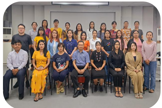
Batch – 27 Group Photo

In accordance with mandatory of MGMA, the purpose of this training is to strengthen compliance with labour law awareness in the garment factories.