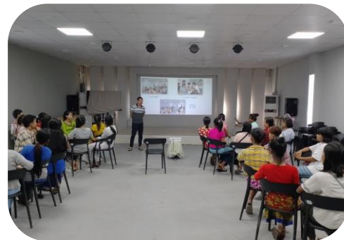
Junior Labour Officer of MGMA presenting Labour Law Awareness