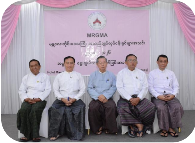
Election Commission Member