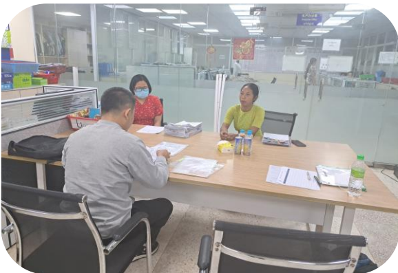
Sunrise Myanmar Co.,Ltd