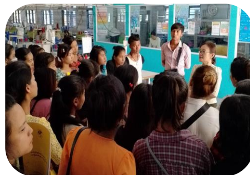
Trainer from MGRDC lecturing sewing method