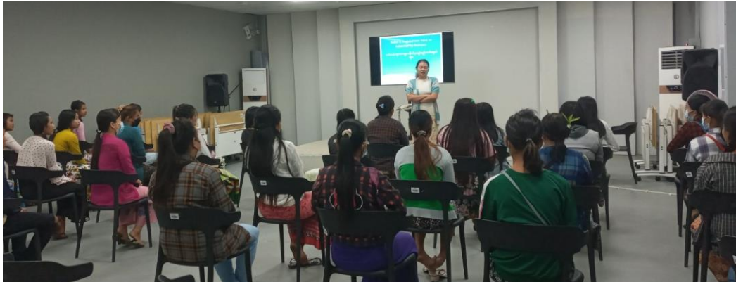
Trainer from MGRDC lecturing sewing method

B asic Sewing Machine Operator Training (Batch – 215) was held on January 23 rd to February 10 th , 2023 at Myanmar Garment Human Resources Development Training Center (MGRDC), organized by Myanmar Garment Manufacturers Association (MGMA).