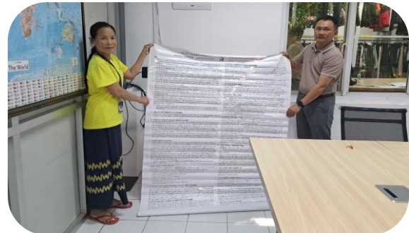
KPH Manufacturing Co.,Ltd