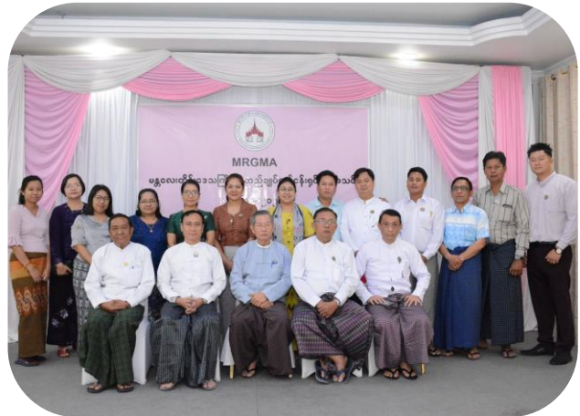
Election Commission and MRGMA's EC Group Photo