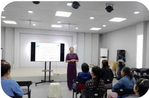
Trainer from MGHRDC lecturing sewing method

In addition, (6) special sewing method such as Buttonhole sewing machine , how to sew button using sewing machine , Bartack Machine, Overlock 4 thread, Overlock 5 thread, 2 Needle taught by trainers from MGHRDC with practice session. The training attended by (10) participants.