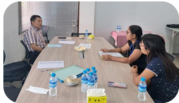
Beaume International Manufacturing Co.,Ltd