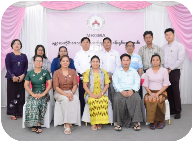
MRGMA's EC Group Photo