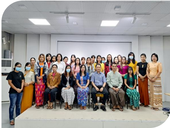
Batch – 10 Group Photo

L abour Law Awareness Training was held on February 14th and 23rd, 2023, at Myanmar Garment Human Resources Development Training Center (MGHRDC), organized as compulsory training of Batch (10 & 11) by Myanmar Garment Manufacturers Association (MGMA).