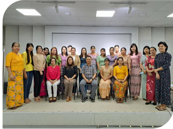
Batch – 11 Group Photo