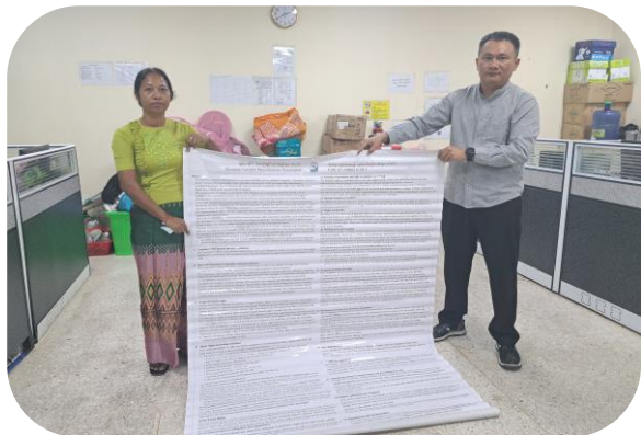
Sunrise Myanmar Co.,Ltd