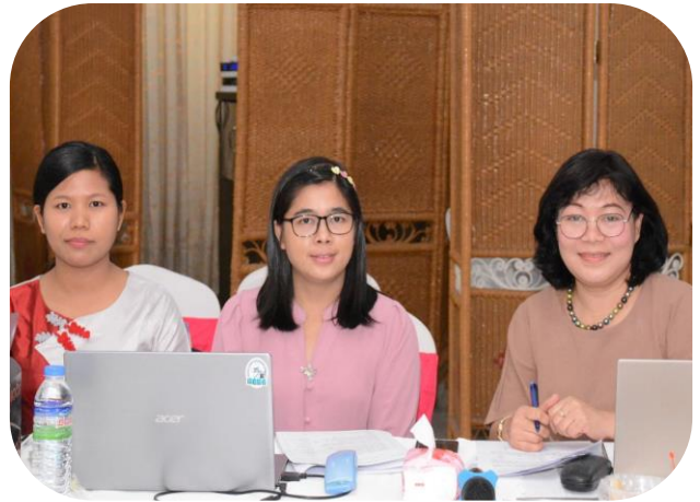
MGMA and MRGMA Office Team Members