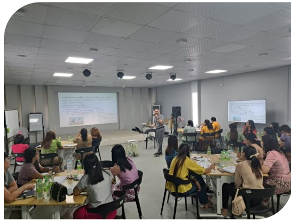
Labour Officer presenting Labour Law Awareness

In accordance with mandatory of MGMA, the purpose of this training is to strengthen compliance with labour law awareness in the garment factories.