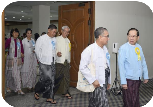
MGMA CEC/ECs and UMFCI Patron