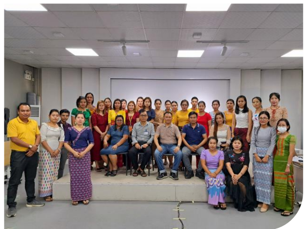
Batch – 13 Group Photo

In accordance with mandatory of MGMA, the purpose of this training is to strengthen compliance with labour law awareness in the garment factories.