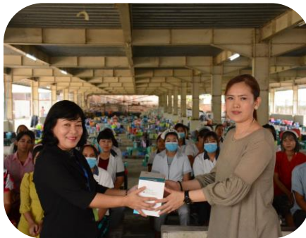
Distributing Covid test kit