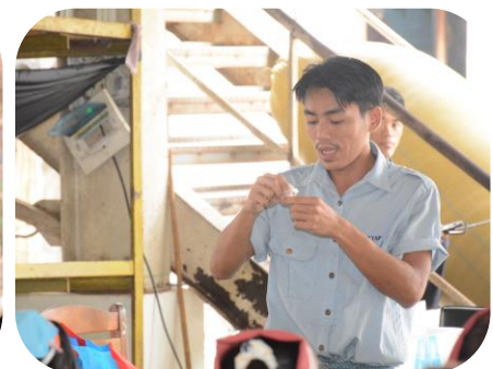
Worker practicing covid test kit