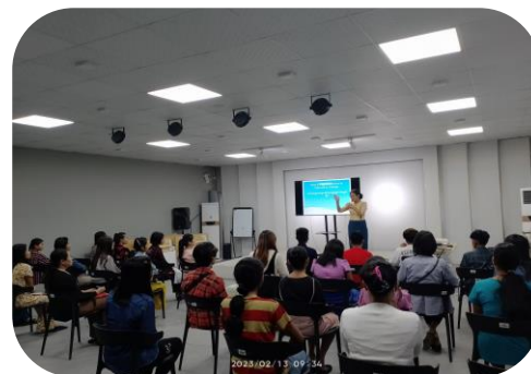
Trainer from MGHRDC lecturing sewing method