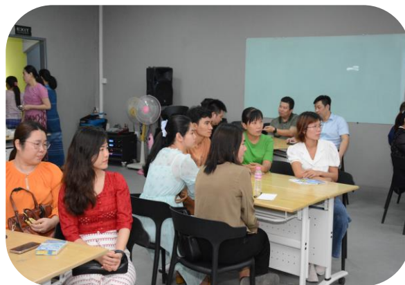
Guests and Participants