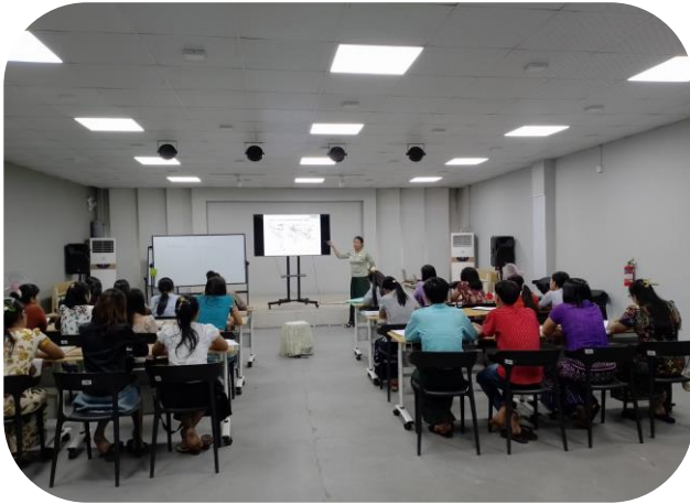
Trainer from MGHRDC lecturing Industrial Engineering