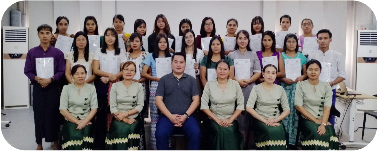
Industrial Engineering Batch – 75 Group Photo