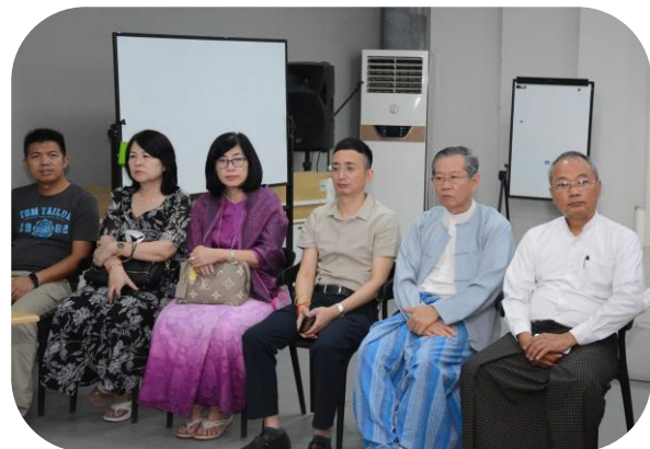
Chairman, Vice-Chairman, CEC-EC of MGMA, Members of CTGA