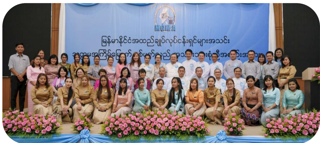
Chairman, Vice Chairmen, Secretary General, CEC-EC members of MGMA and MGMA office team