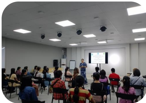
Trainer from MGHRDC lecturing sewing method

In this training, training instructor from MGHRDC lectured knowledge of sewing and sewing method step by step with practice session. MGMA conducted the awareness of labour law in factory. Total (24) participants attended the training and awarded certificate.