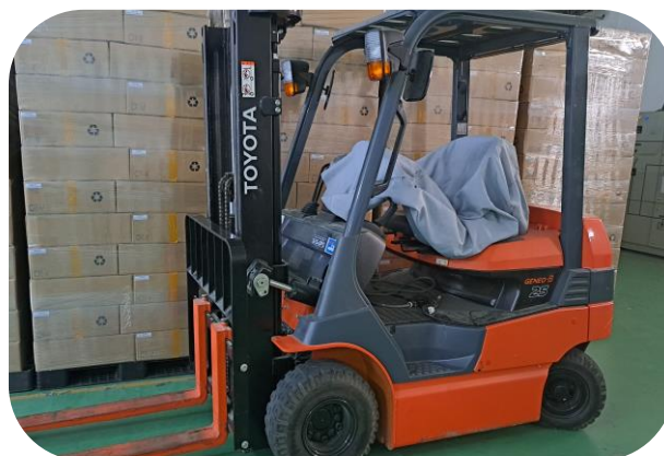
Matsuya R & D Myanmar Co.,Ltd,