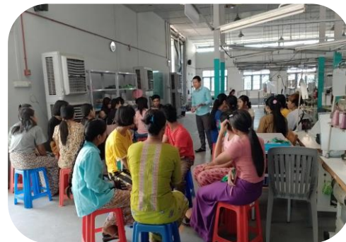
MGMA conducting the awareness of labour law