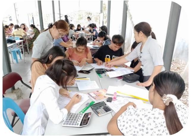
Factory Practice Information preparation