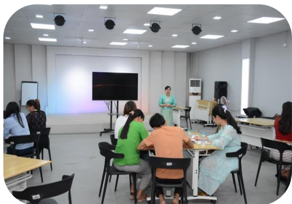
Trainer from YUFL presenting interpreters' skill