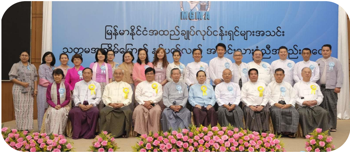
Vice - chairman of UMFCCL, Chairman, Vice Chairmen, Secretary General and CEC-EC members of MGMA

7 th Annual General Meeting of Myanmar Garment Manufacturers Association (MGMA) was held on 19th March 2023 at UMFCCL, Mingalar Hall.