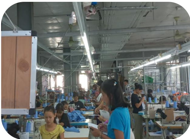
Factory Practice at Thiri Sandar Garment