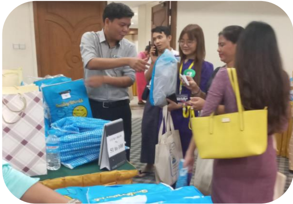
Exchange factories product