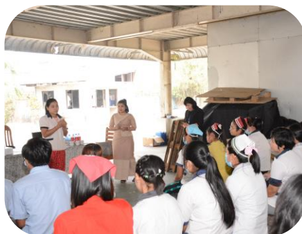
Worker practicing covid test kit