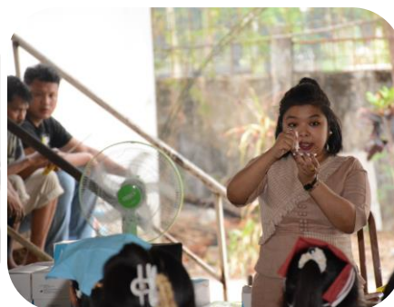
Project officer of MGMA Demonstration how to use covid test kit