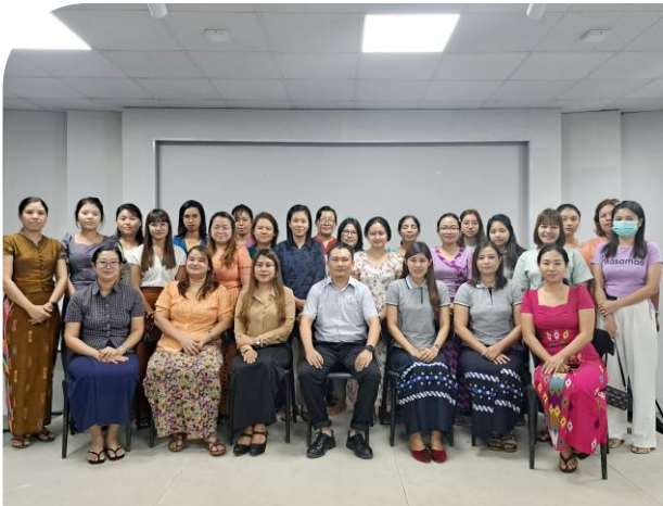
Batch – 12 Group Photo

L abour Law Awareness Training was held on March 10 th and 22 nd , 2023, at Myanmar Garment Human Resources Development Training Center (MGHRDC), organized as compulsory training of Batch (12 & 13) by Myanmar Garment Manufacturers Association (MGMA).