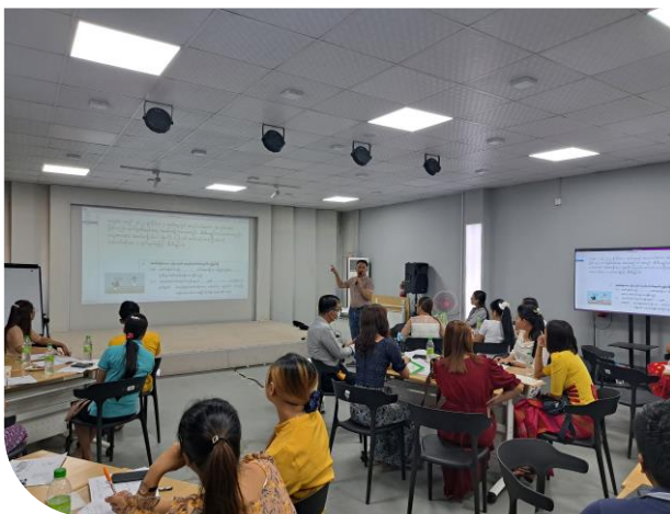
Labour Officer presenting Labour Law Awareness