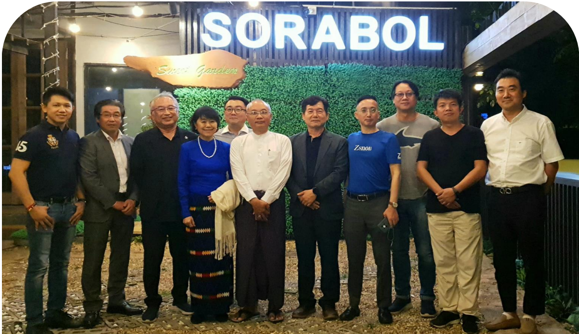
REPRESENTATIVE FROM 4 GARMENT ASSOCIATION IN MYANMAR GROUP PHOTO

Korea Garments Association in Myanmar (KOGAM) organized the regular exchange meeting of garment sector development with foreign garment association in Myanmar. The meeting dinner was held on May 27, 2022 at Sorabol Korean Restaurant Golden Valley with 4 garment associations of MGMA (Myanmar), KOGAM(Korea), JGMA (Japan) and CTGA (China). Chairman, Secretary General and some CECs were joined together and exchange recent factories' situation of garment sector in the meeting.