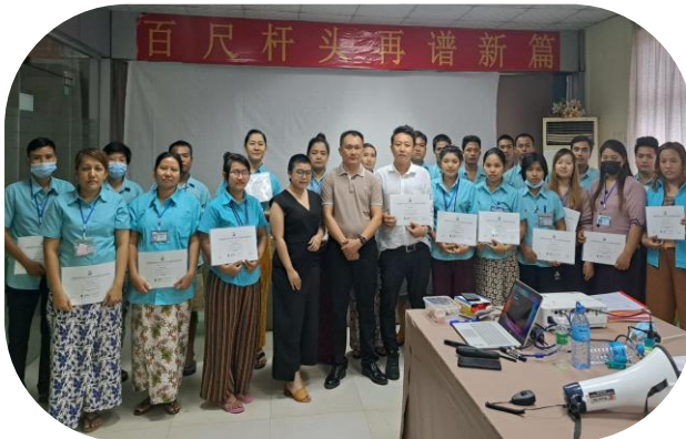
HUABO TIME TEXTILES & CLOTHING CO.,LTD

Labour Law Awareness is one of the soft skills required by garment workers and the training attended by (24) participants from He Shan Myanmar Garments Co.,Ltd, (24) participants from Huabo Time Textiles & Clothing Co.,Ltd and (27) participants from Amava Apparel Ltd.