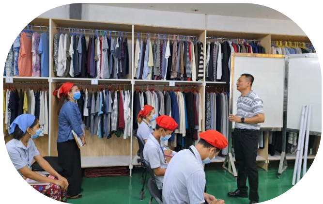
EXPLAINING PROJECT'S OBJECTIVES