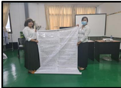
HE SHAN MYANMAR GARMENTS CO.,LTD