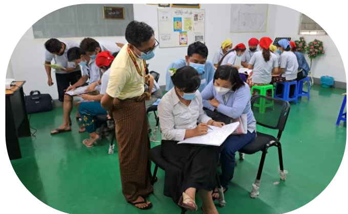
GROUP WORK AT HE SHAN CO.,LTD