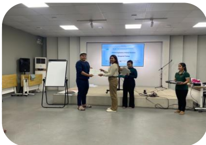
EC OF MGMA U YE KHANT AWARDING CERTIFICATE