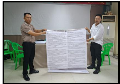
HUABO TIME TEXTILES & CLOTHING CO.,LTD