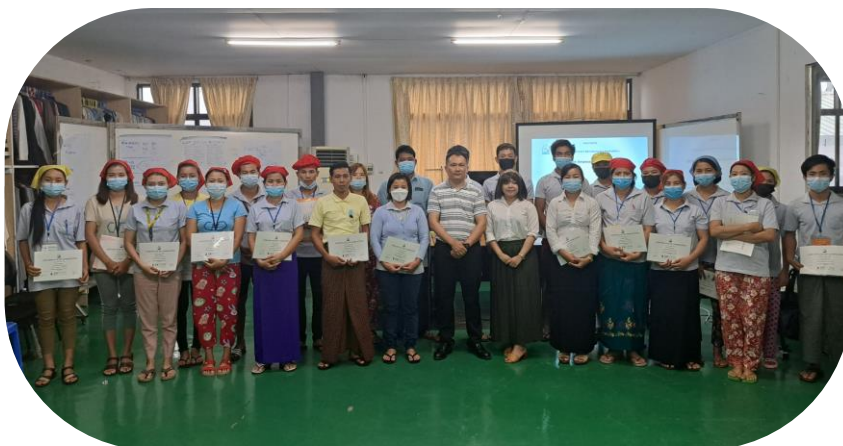
HE SHAN MYANMAR GARMENTS CO.,LTD