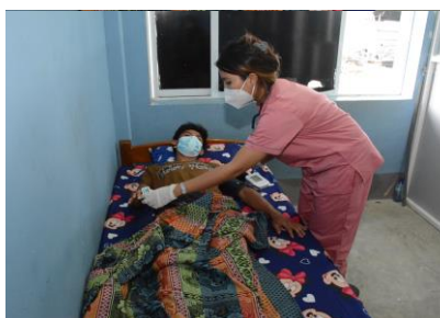
MEDICAL CHECK UP