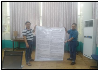
UNIQUE HTT CO.,LTD

between MGMA and ILO/ACTEMP, Bureau for Employer Activity under International Labor Organization, in 2019. VLCA was officially launched on 17th Feb 2020 by MGMA to all its member factories.