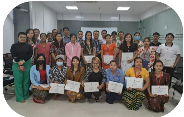
AMAVA APPAREL LTD