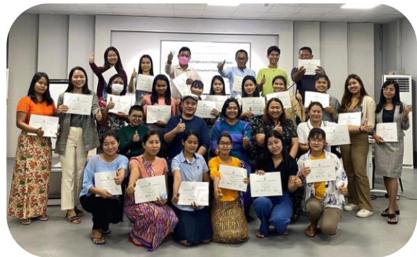
PARTICIPANTS GROUP PHOTO