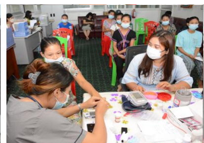
BLOOD TESTING FOR DIABETES