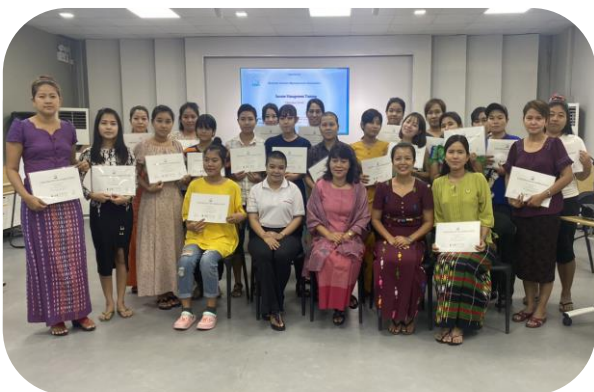
PARTICIPANTS GROUP PHOTO