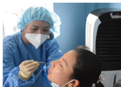
COVID – 19 TEST