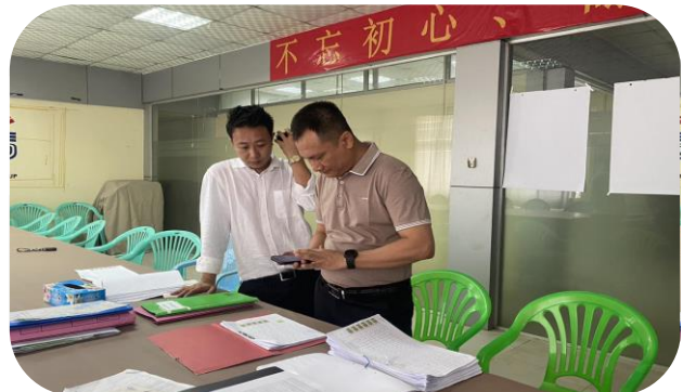
HUABO TIME TEXTILES & CLOTHING CO.,LTD