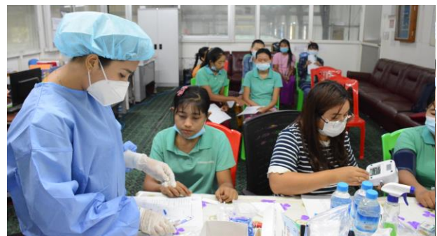
MEDICAL CHECK UP