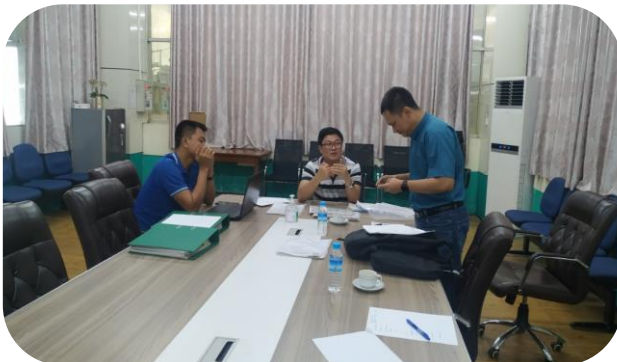
UNIQUE HTT CO.,LTD