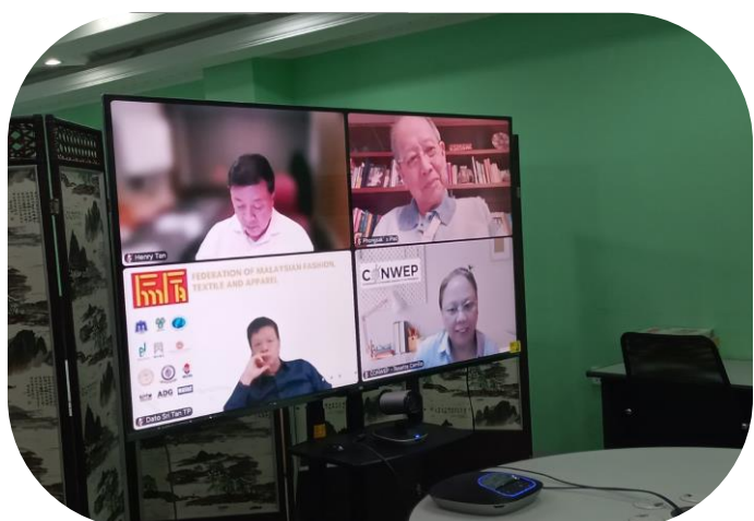
CHINA AND ASEAN MEMBER STATES

The conference attended by representatives from Vietnam Textile and Apparel Association (VITAS), Garment Manufacturers Association in Cambodia (GMAC), Indonesia Textile Association (API), Association of the Lao Garment Industry (ALGI), Malaysian Textile Manufacturers Association (MTMA), Myanmar Garment Manufacturers Association (MGMA), Confederation of Garment Exporters of the Philippines (CONGEP), Singapore Textile and Fashion Federation (TAFF), The National Federation of Thai Textile Industries (NFTTI).