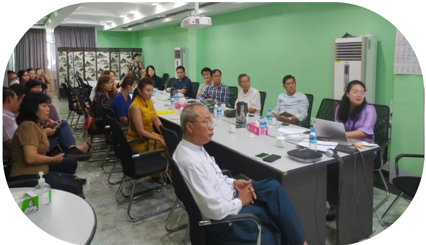
MEETING WITH A BANK

The Monthly MGMA Executive Committee Meeting and Meeting with “A Bank” was held on May 21, 2022 at MGMA meeting room. Managing Director of MGMA chaired the meeting. In the meeting, CEC/EC members were discussed each other about difficulties of C/O process on website , next process of MGMA, activities of collaborative project, working on member factories difficulties and Voluntary Labor Compliance Assessment (VLCA) inspected member factories with online system.