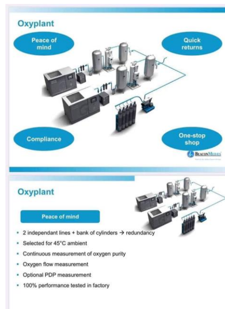
YANGON GENERAL HOSPITAL COVID-19 CONTROL CENTER (NEW ICU) OXYGEN PLANT SET UP