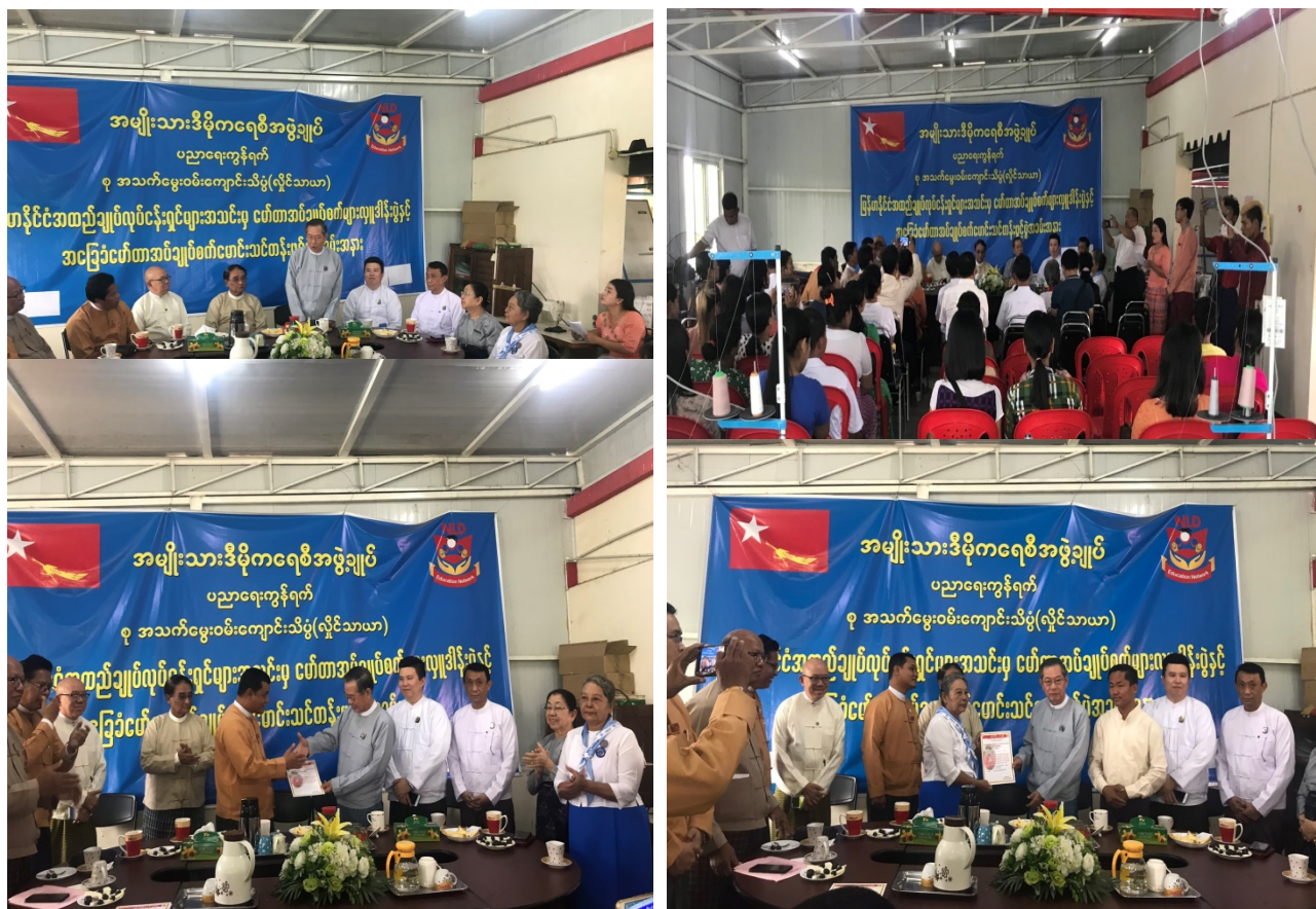
Donation Session and participants of Donation