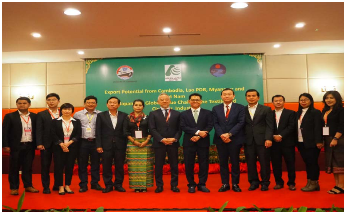
Group Photo of Representatives

The 'CLMV to Japan and global value chain in textile industry' workshop was held by the leading of Asian-Japan center (AJCJ) on February 13,14 2020 in Phnom Penh, Cambodia.