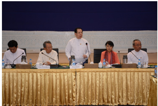
Chairman and Secretary from UMFCCL and MGMA