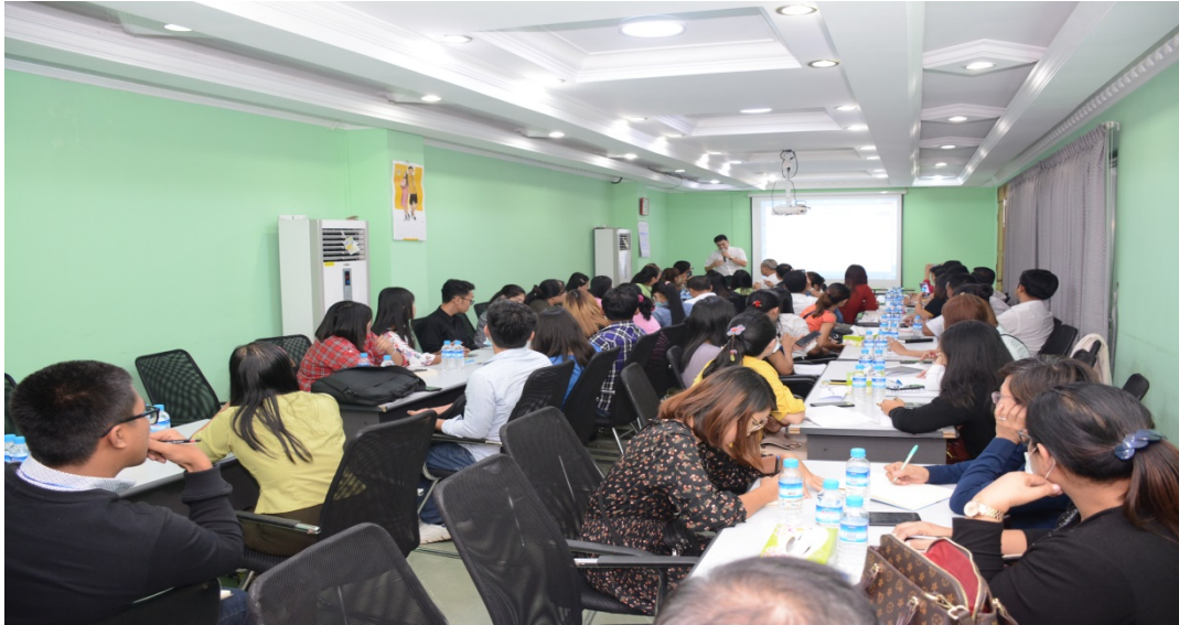
Participates in the meeting session

The meeting for 'Using House BL' held in Myanmar Garment Manufacturers Association (MGMA) on February 6, 2020, Chairman of MGMA, and members of MGMA participated in the meeting.