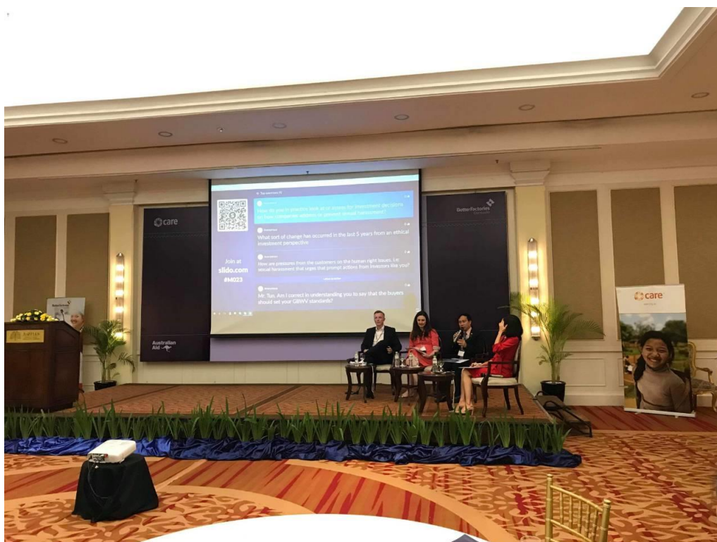
CEC U Tun Tun discussing about Women in Business

During two days event, participants from different countries explored key issues and general solutions for the prevention and resolution of sexual harassment. Participants also presented a variety of local and international perspectives.