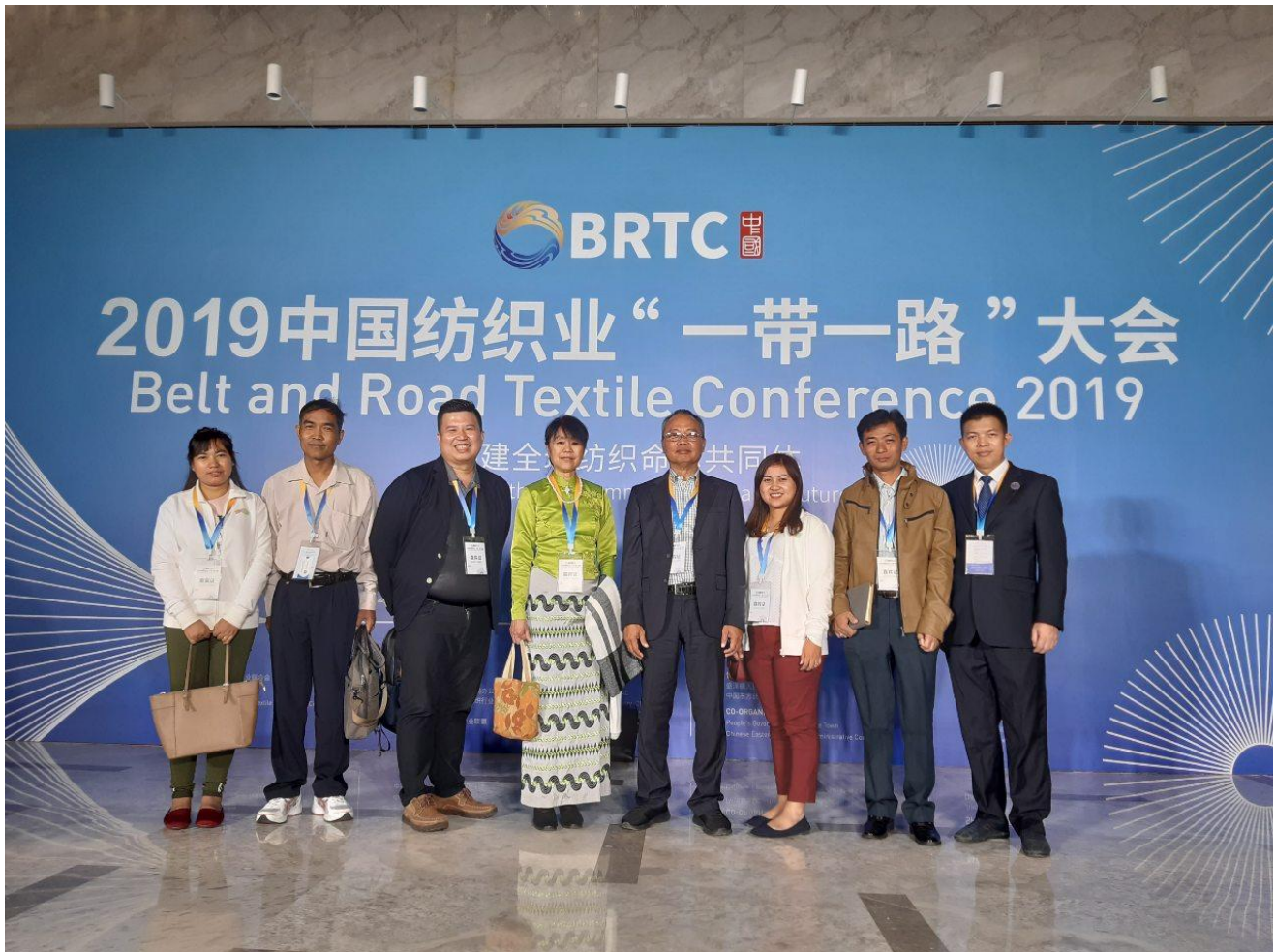
MGMA General Secretary, CEC, MGRDC Director, MGMA Staffs were attending the BRTC 2019

thoughts and discussed the win-win cooperation opportunities in textile and garment industry under the Belt and Road Initiative.