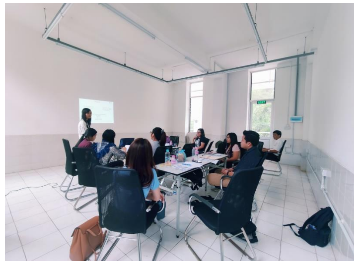
Photo 1 Trainers from SMART Myanmar and trainees from MGMA and MGHRDC Photo 2 Evaluation session from one of trainees