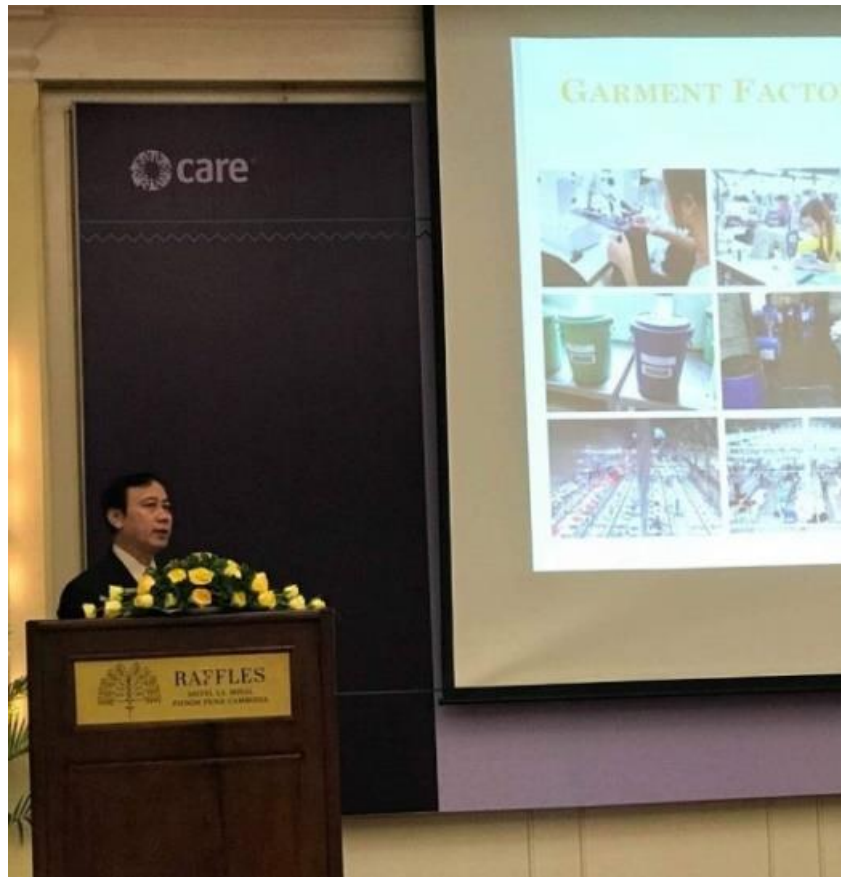
CEC U Tun Tun presenting about MGMA at Business Women at Work event

During two days event, participants from different countries explored key issues and general solutions for the prevention and resolution of sexual harassment. Participants also presented a variety of local and international perspectives.