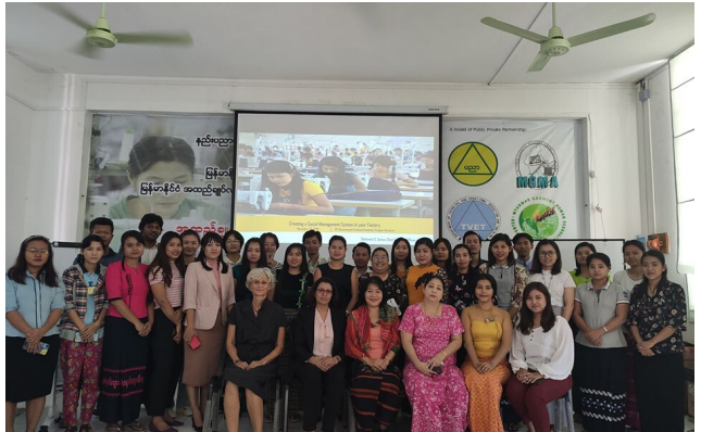
Advance Social Compliance Workshop Page -5