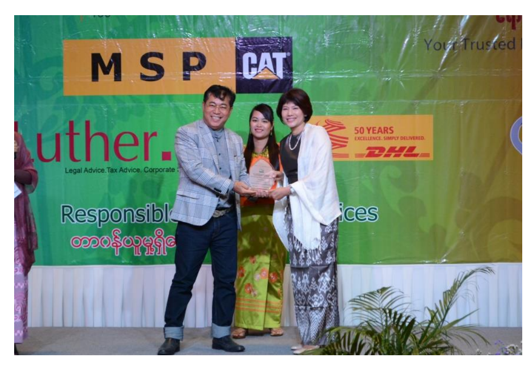
The Garment Factory of the Year 2019 winner accepting

Myanmar Garment Manufacturers Association (MGMA) greatly and honorary performed the "MGMA's 6th Annual Factory Award Dinner 2019" at Melia Hotel, Yangon on the November 2nd 2019 with collaboration in sponsored by MTG (Myanmar International Textile & Garment Industry Exhibition), AYA Bank, MSP-CAT (Generator), Korea Garment Association, Luther Law firm, DHL, OV Logistic & Shipping Line (PHEE).