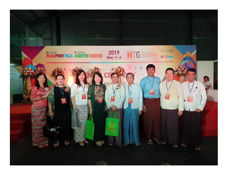
CEC and EC group photo

"The 8th Myanmar Int'l Textile & Garment Industry Exhibition 2019" is the demonstration of products and services of domestic and foreign enterprises, searching for partners, and adjustment of the trade turnover between countries. MTG 2019 is an ideal business-tobusiness platform for industrial companies to import & export equipment, seek cooperation, exchange ideas, look for potential investment, learn trend & advance technologies.