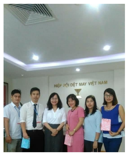
VTG & MGMA group photo