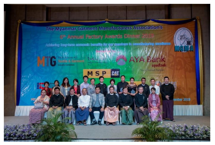
Photos 1: CEC and EC Group Photo with Deputy Minister, Photo 2: Group photo with awarded factories Vice-Chairman of UMFCCI

Myanmar Garment Manufacturers Association (MGMA) greatly and honorary performed the "MGMA's 6th Annual Factory Award Dinner 2019" at Melia Hotel, Yangon on the November 2nd 2019 with collaboration in sponsored by MTG (Myanmar International Textile & Garment Industry Exhibition), AYA Bank, MSP-CAT (Generator), Korea Garment Association, Luther Law firm, DHL, OV Logistic & Shipping Line (PHEE).